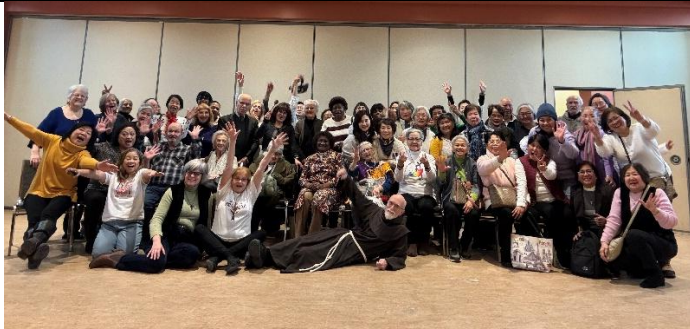
Secular Franciscans from the Quebec Area gathered in Montreal for their annual Variety Show in January 2025. A very good time was had by all!